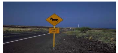
See ya next time!

An animal's eyes have the power to speak a great language.