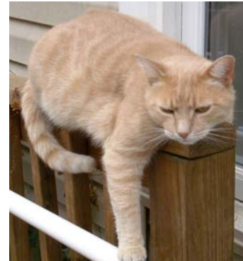
Me, hard at work!

"In a cat's eyes all things belong to cats." - English saying