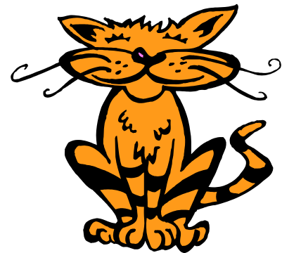
Cosmo's Self Portrait.