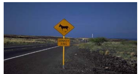
See ya next time!

"I think we are drawn to dogs because they are the uninhibited creatures we might be if we weren't certain we knew better." - George Bird Evans, "Troubles with Bird Dogs"